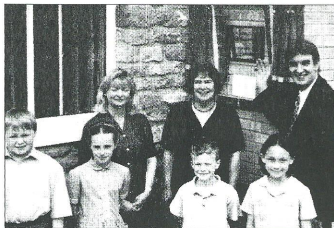
5. Opening new classrooms at Maidwell School

I represent a large rural area and I have regular contact with Parish Councils, the NFU, and schools in addition to regular advice surgeries in villages across the constituency