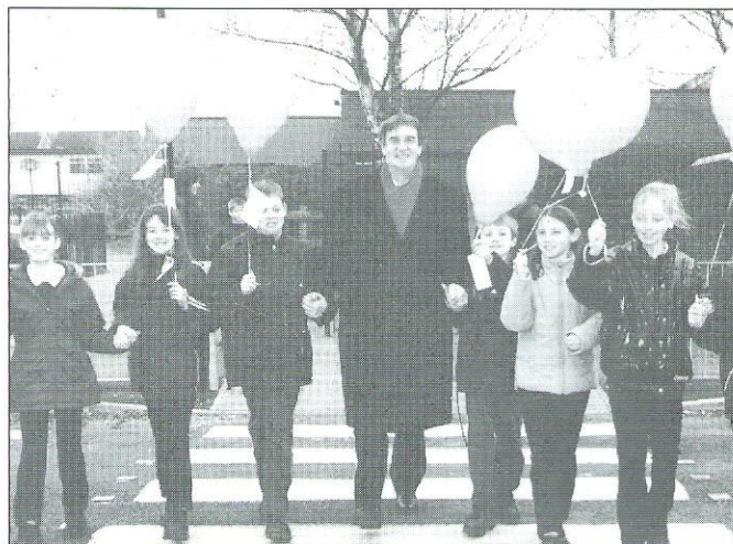
1. Opening the pedestrian crossings on the Ise Village

In addition to the investment in our school buildings, class sizes for younger pupils have been cut (In Northamptonshire the number of 5,6 and 7 year olds in classes of over 30 was 22% in 1997, this has been reduced to just over 2%).