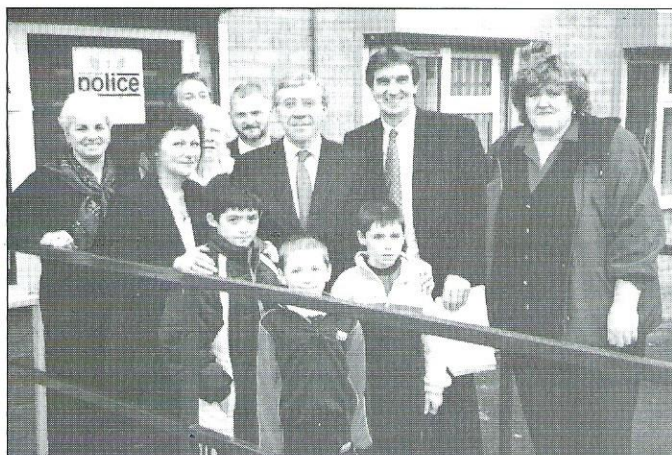
4. Home Secretary Jack Straw at the Highfield Road community office, Kettering

Northamptonshire people will be seeing more and more police officers on the beat over the coming months due to the extra resources to recruit 90 additional officers over the next three years. Fifty officers are already in post undertaking their initial training.